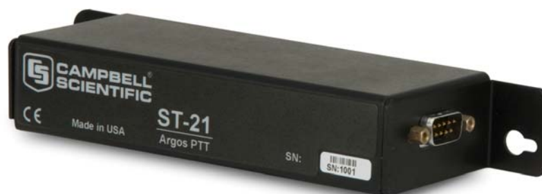
Figure 1-2. The ST-21's 9-pin connector attaches to the datalogger via the SC12 cable