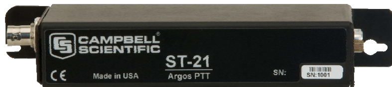
Figure 1-1. ST-21 Argos Satellite Transmitter

The ST-21 is a certified Argos PTT satellite transmitter for use with Campbell Scientific CRBasic dataloggers. Service Argos data transceivers fly aboard two NOAA polar orbiting satellites. With an orbit altitude close to 800 kilometres, the satellites are at a relatively low orbit. The low orbit allows for low transmit power, low battery power requirements and the use of an omni-directional antenna. The orbit period is approximately 1 hour and 45 minutes, which allows hourly data at extreme northern and southern latitudes. Near the equator there are about six satellite passes per day that are not evenly spaced. During the average satellite pass, the satellite is in view for about 10 minutes.