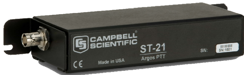
Figure 3-1. The ST-21's BNC connector attaches to the antenna via the antenna cable

The ST-21's BNC connector is for attaching the antenna (see Figure 3-1).